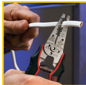
12/2 and 14/2 NM Cable Stripper